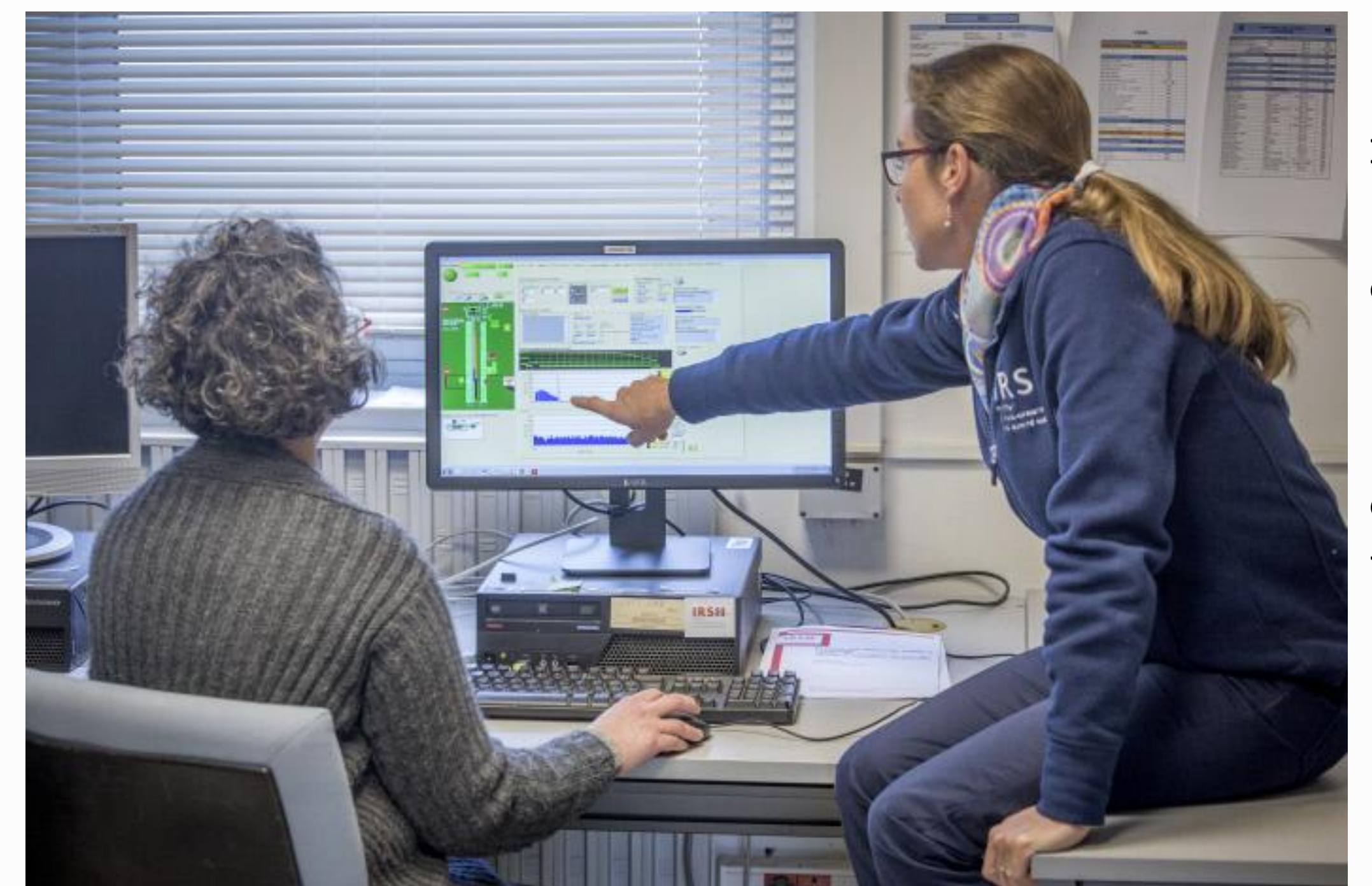
Crédits : Jean-Marie Huron/Signatures/Médiathèque IRSN Support original : Photographie