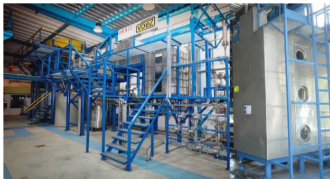
Figure 3 – The VIKTORIA Test Facility

For this project, the VIKTORIA test facility includes key features (same filters - at reduced scale - as the ones installed on French NPPs, debris injection and mixing tanks, simulated fuel assemblies) in order to obtain the most representative conditions possible according to IRSN. The tests have been carried out for all types of filters.