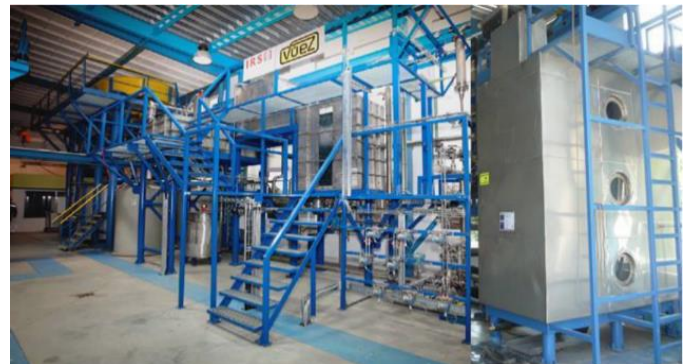
Figure 3 – The VIKTORIA Test Facility

For this project, the VIKTORIA test facility includes key features (same filters - at reduced scale - as the ones installed on French NPPs, debris injection and mixing tanks, simulated fuel assemblies) in order to obtain the most representative conditions possible according to IRSN. The tests have been carried out for all types of filters.