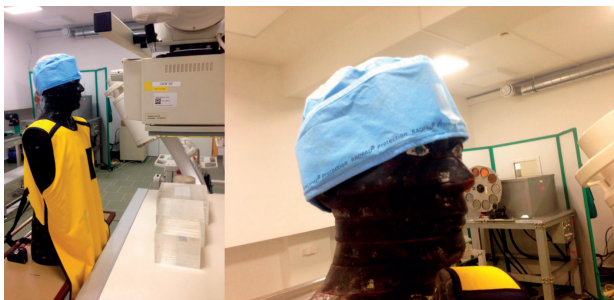
Figure 2. The geometry of the measuring system in the laboratory

being performed by the physician working in the second center. In total, 14 measurements were performed including doses from 291 procedures. Moreover, only 3 dosimeters outside and inside the lead free cap were attached in the regions of the highest exposure as determined during the first phase: on the left temple, on the left eyebrow and on the forehead between the eyes (Figure 1).