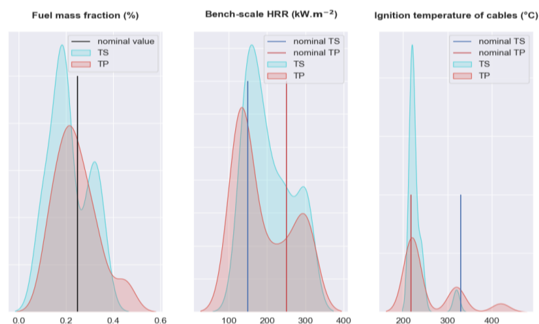
Figure 3: Comparison between the probability density functions of three input parameters (mass fraction, the bench-scale HRR per unit of area and ignition temperature) and their default values for thermoset (TS) and thermoplastic (TP) cables

To assess their physical relevance, the input data optimized by the expert system is compared with the default data. Figure 3 shows the results for 3 inputs, comparing the distribution of optimized values with the default value(s). For the fuel mass fraction, the value that best reproduces the experimental results may be significantly different from the default value. This indicates that this parameter may be the cause of modelling that is too far from experiment. The findings on the other two input quantities also indicate that the default values are probably too restrictive to reproduce the experiments.